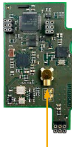
Antenna connection for the RF antenna on the GSM9i-4G/RF module