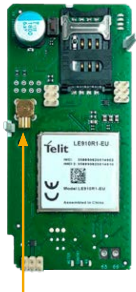
Antenna connection for 4G antenna on the GSM9i-4G and GSM9i-4G/RF module