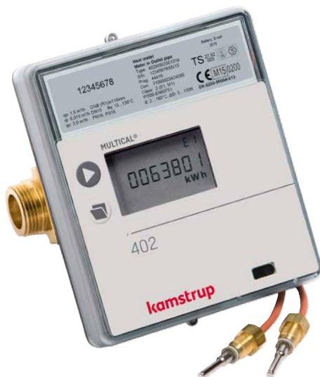
MULTICAL® 402 with threaded sensor

Accuracy class 2 or 3, wide dynamic range ( q_p/q_i 100:1), and the high permanent overload capability ( q_s/q_p 2:1) are standard features.