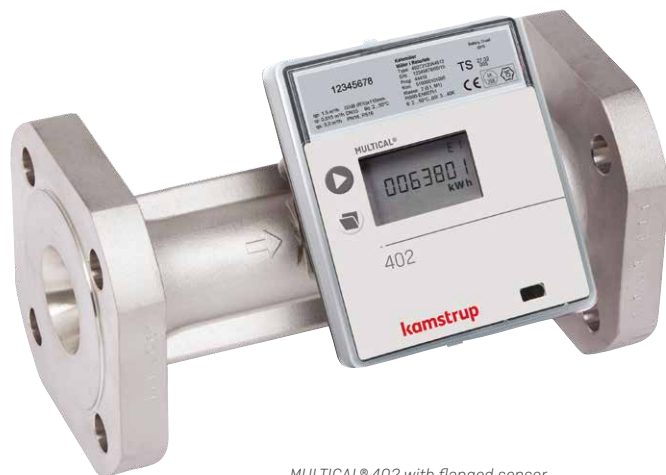
MULTICAL® 402 with flanged sensor